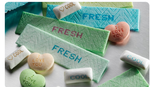
Food and Confectionery