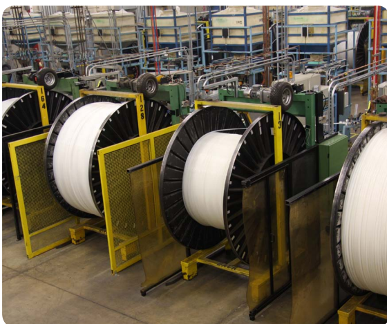
Spools of tubing in Uponor’s facility in Apple Valley, MN.

In addition to the ease of integration, Videojet also offered Uponor a wide selection of ink options. This is important given Uponor needed to find inks that would adhere and withstand extreme temperatures and the life of the pipe. While the testing was extensive – Uponor needed to run through 10 to 16 different internal tests, some of which took four weeks – Videojet was up to the task and supplied many inks for these tests to uncover the right ones for Uponor’s unique applications.