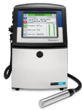
Videojet 1650 UHS continuous inkjet printer

All Videojet solutions feature CLARiTY™ – a large, touch screen, intuitive user interface that provides ease of use and continuity for all operators, regardless of expertise, knowledge and printer interaction. Our built-in CLARiSUITE™ software helps you comply with food labelling standards and meet new demands for additional label content. It also offers Code Assurance features to make job creation, edits and product changeovers simple and practically impossible to get codes wrong.