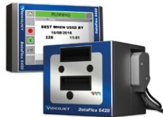
Videojet DataFlex 6420 thermal transfer overprinter